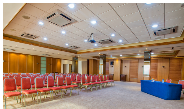
Triton Conference Center