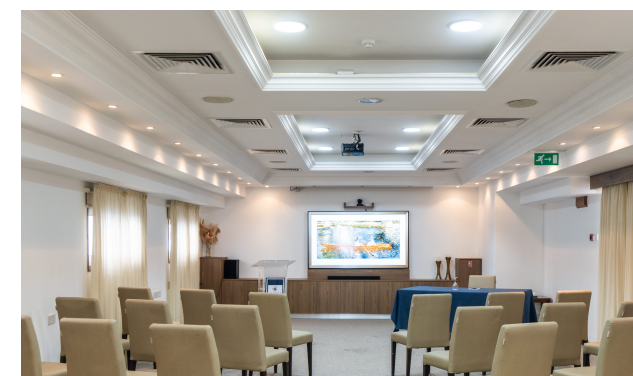
Arethusa Conference Hall