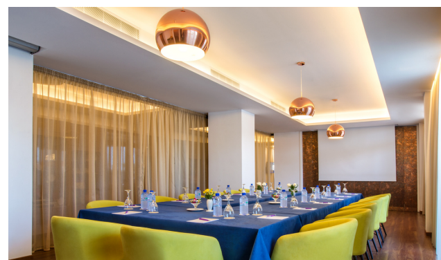
Thetis Study Hall